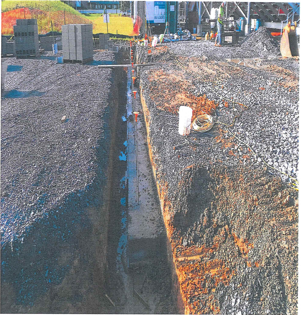
Concrete Footer Placement