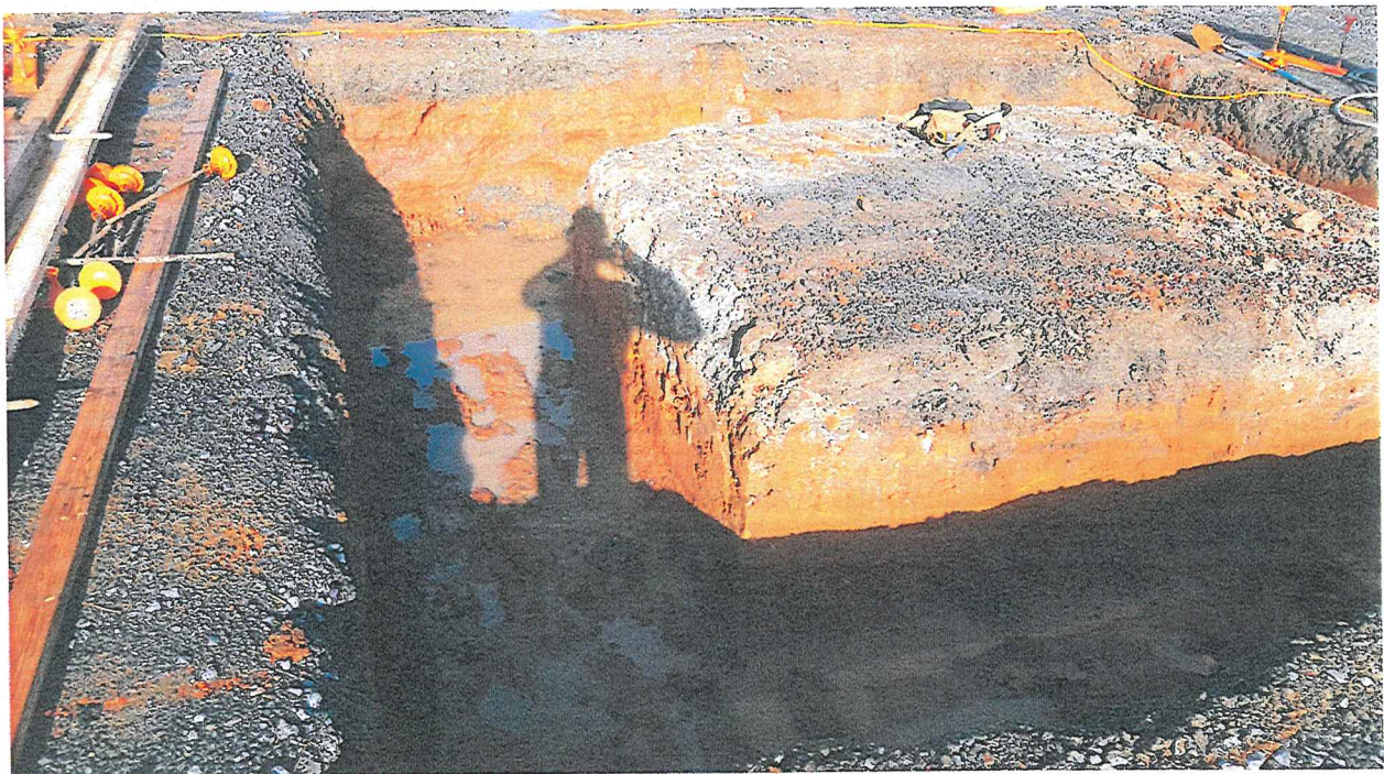
Large Ticket Boot Footing Excavation