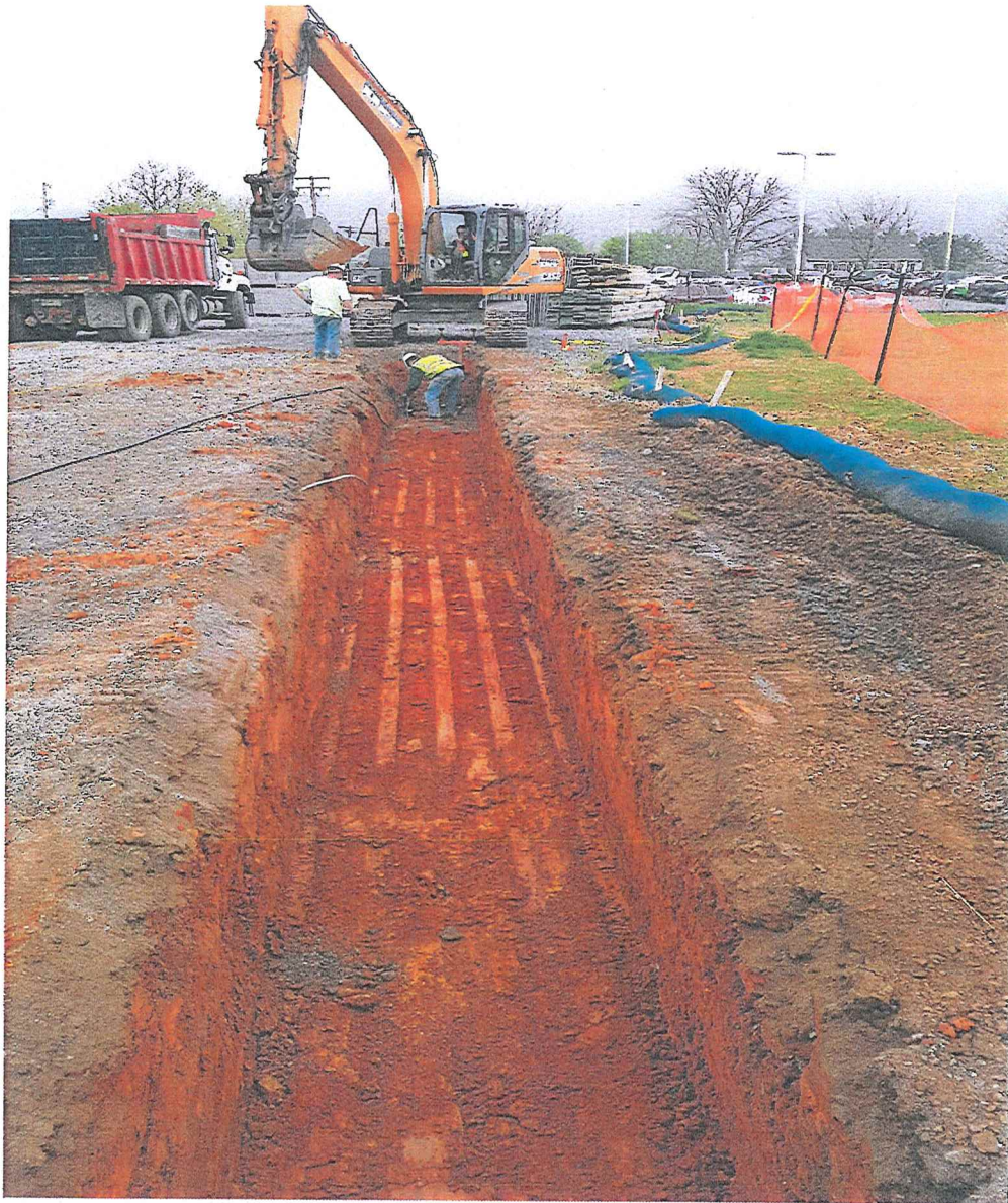
Women's Restroom Footing Excavation