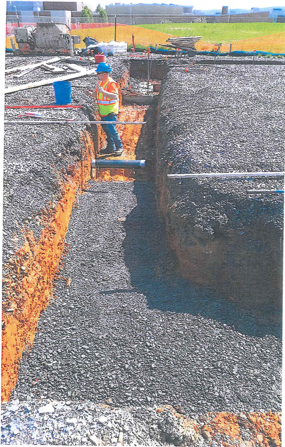
Sleeve Placement in Footing for Water / Sewer