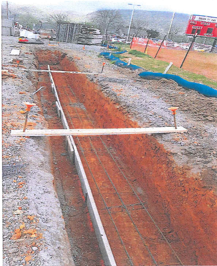
Rebar Reinforcement for Footings